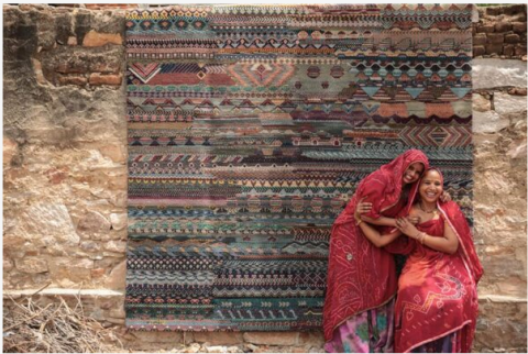
Jaipur Rugs has earned a great reputation in India and Abroad